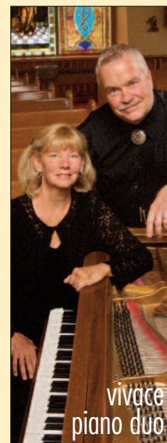
vivace piano duo